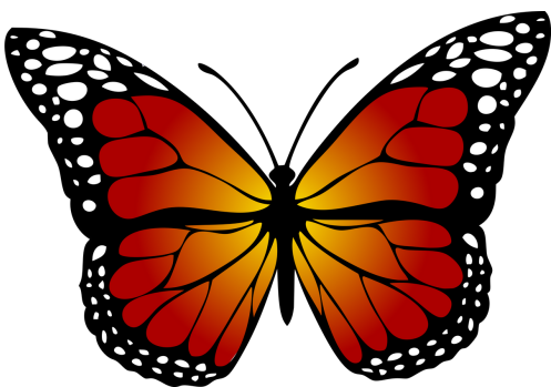
Adult Monarch butterfly