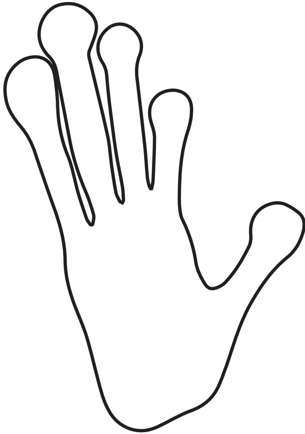
Coquerel's sifaka (hand) ( Propithecus coquereli )

Fun fact: Lemurs have opposable thumbs and big toes. Grasping hands and feet help lemurs navigate their way through the forest.