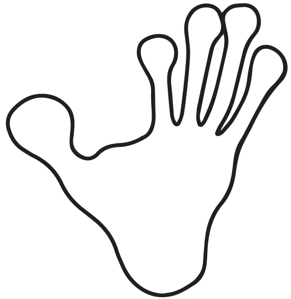
collared lemur (foot) ( Eulemur collaris )

Fun fact: Lemurs have opposable thumbs and big toes. Grasping hands and feet help lemurs navigate their way through the forest.