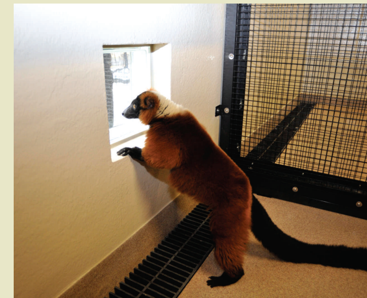
Red-ruffed lemur enjoys a lemur-sized window designed to mimic the dappled sunlight of the forest

See http://dukelemurcenter.blogspot.com for updates on Charlie’s travels in Madagascar.